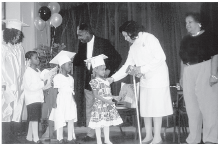
A family graduating from FAST in Washington, DC.

Ninety-one percent of FAST parent graduates report an increased involvement in community activities, even though one-third of this sample never attended FASTWORKS. Parent activities 2–4 years after the FAST program include pursuing further education for themselves (44 percent), attending church (35 percent), and obtaining employment (55 percent). Some parents reported greater involvement in more than one activity. After participating in FAST, most families no longer feel socially isolated and both youth and parents report the availability of stronger formal and infor-